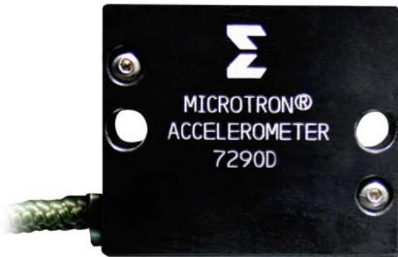
Figure 1 Model 7290D variable capacitance accelerometer.

Endevco VC accelerometers are ideally suited for operation with piezoresistive bridge signal conditioners found in many modern data acquisition systems. When using these accelerometers with a bridge signal conditioner, 10 Vdc excitation should be selected.