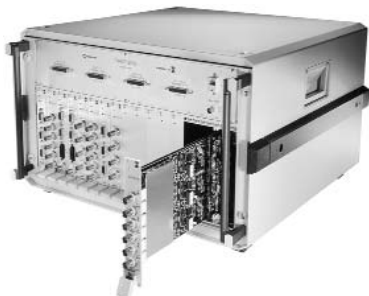
Figure 2 Model 4990 with inserted cards