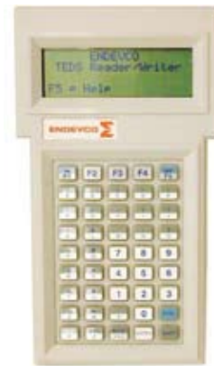
Figure 3 Model 36004