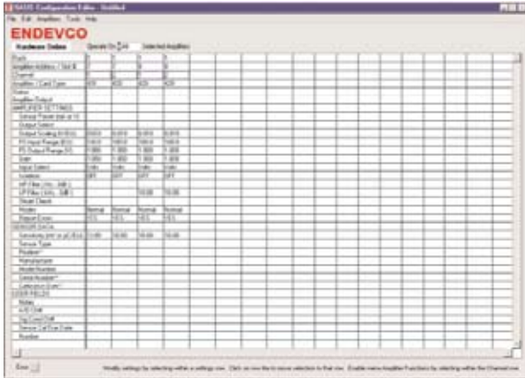
Table 1 OASIS SW2000 software configuration editor

SW2000 software can operate in either "On-line" or "off-line" mode. On-line mode provides the user with instantaneous hardware control, displays actual settings, and provides status information of the OASIS hardware. Off-line mode allows the user to develop and store various measurement system configurations without requiring hardware to be present. Up to 16 racks containing any mixture of the 4XX series amplifiers can be controlled with this software. The OASIS software configuration window is depicted in Table 1.