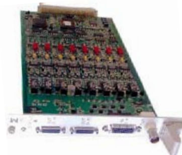
Figure 1 Model 482