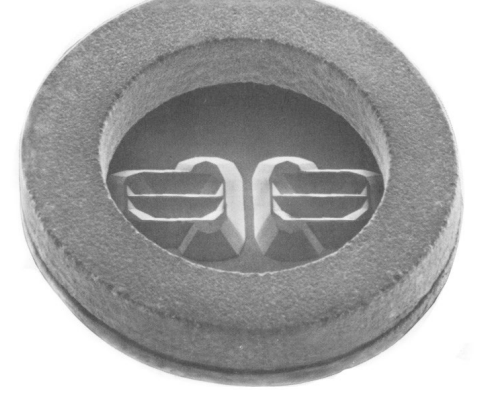
Figure 3 – Photograph of diaphragm, glass-bonded to heavy silicon ring, 0.1 in (2.5 mm) O.D> by 0.02 in (0.5 mm) thick.

The sculpturing of the diaphragm explains a significant part of the benefits of the Endevco design, but not all. Optimizing the piezoresistive characteristics is also important. The piezoresistive coefficients of silicon semiconductor materials vary with the direction of stress in the crystal and with the dopant material and its amounts. Most prior art devices have been designed to stress the gage material so that the gage increases its length. If such a gage were placed in the stress concentration groove of the sculptured diaphragm, it would be stitched back and forth from one end to another – a miniaturization of the larger wire and foil gage approaches. As the groove bends, the effective gage length would change.